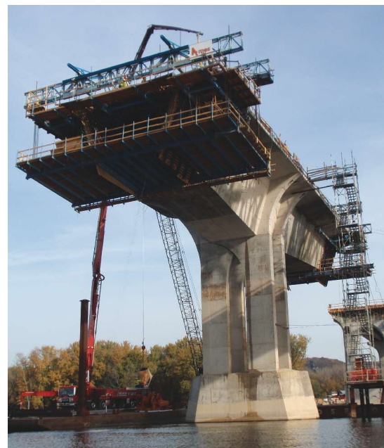
The main river spans utilized the cast-in-place balanced cantilever construction method.

The concrete box-girder structure type was selected for the new bridge based on criteria that included assessment of the visual impact to the historic bridge. Since 1941, the graceful historic cantilever through-truss had become an iconic structure in Winona. Preliminary