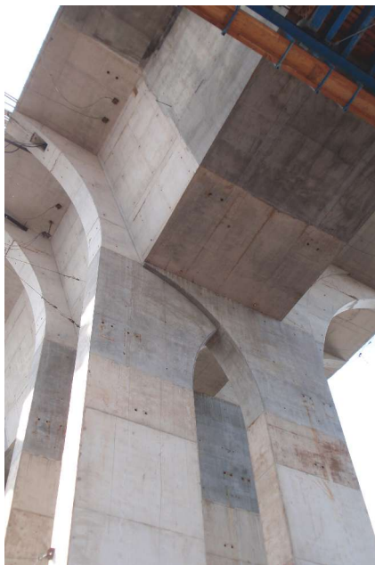
Main river piers are 3 ft by 9 ft 6 in. and extend 45 ft above the top of the ice breaker to the pier table.