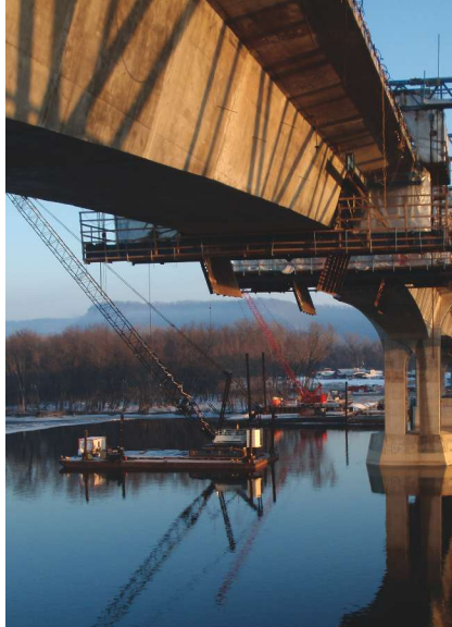
The segmental box girder, which mirrored the historic cantilever through-truss, gained acceptance and was also the most cost-effective alternative.

With preliminary design studies nearing completion in May 2013, the MnDOT District team and Bridge Office team agreed to a very aggressive schedule using the construction manager/general contractor (CM/GC) project delivery method for the final design and construction of Bridge 85851 just upstream of the Bridge 5900.