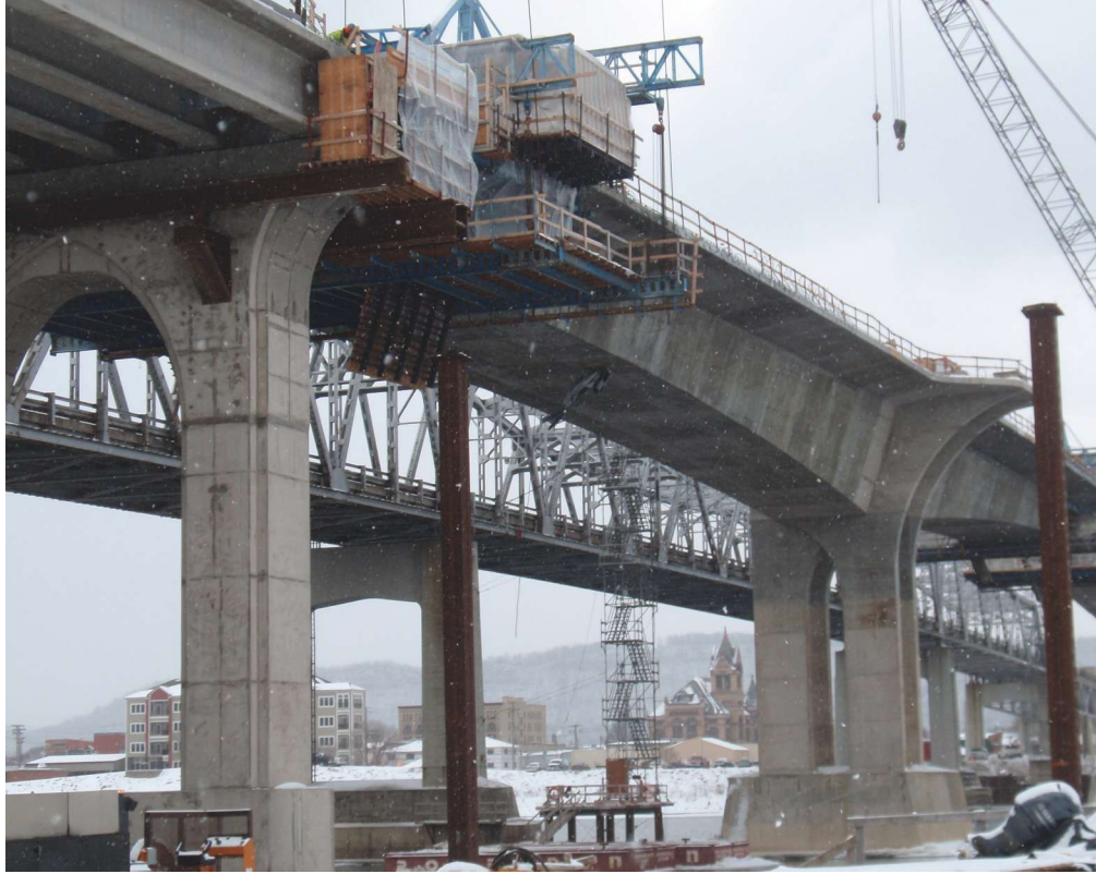
Form travelers with suspended heated enclosures enabled concrete for the segments to be placed throughout the winter.

MnDOT used a CM/GC collaborative process with a first-time construction engineering innovation that included the engineer of record (EOR), peer reviewer, CM/GC, and the post-tensioning subcontractor. Models developed by the EOR for the design and peer review were updated with information provided by the contractor's suppliers, leading to a seamless effort to produce integrated segmental girder shop drawings by the EOR. Collaboration before letting allowed for early production of complex pier table segments, and other segments that were on the critical path, rather than the contractor beginning development of shop drawings after