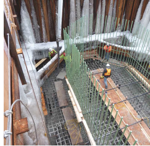
An early foundations contract was used to accelerate construction of the river pier foundations.

Construction on the new bridge began in July 2014, and the construction team worked through the winter of